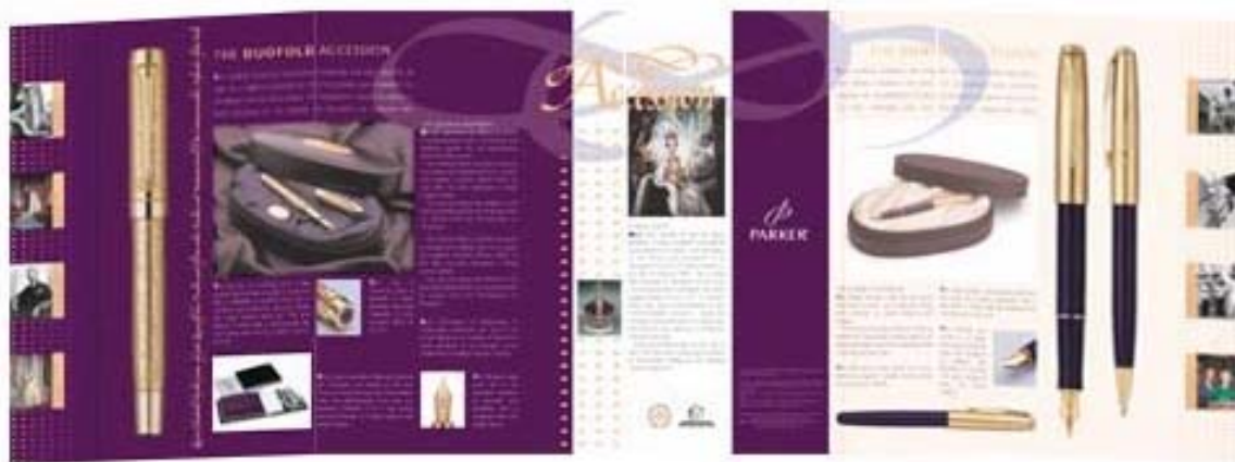
4 page inside spread