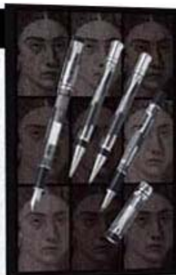
Fold-in (Page 5)