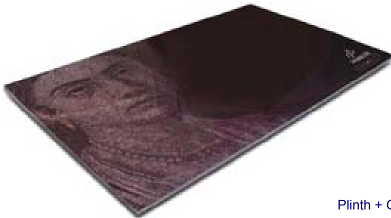
Plinth + Gift Box (on stand) + Mini-showcard