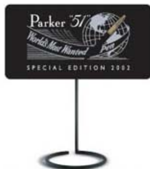
'World's Most Wanted Pen' freestanding showcard