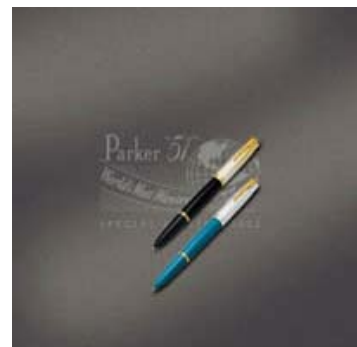
P51 02 SE PR4